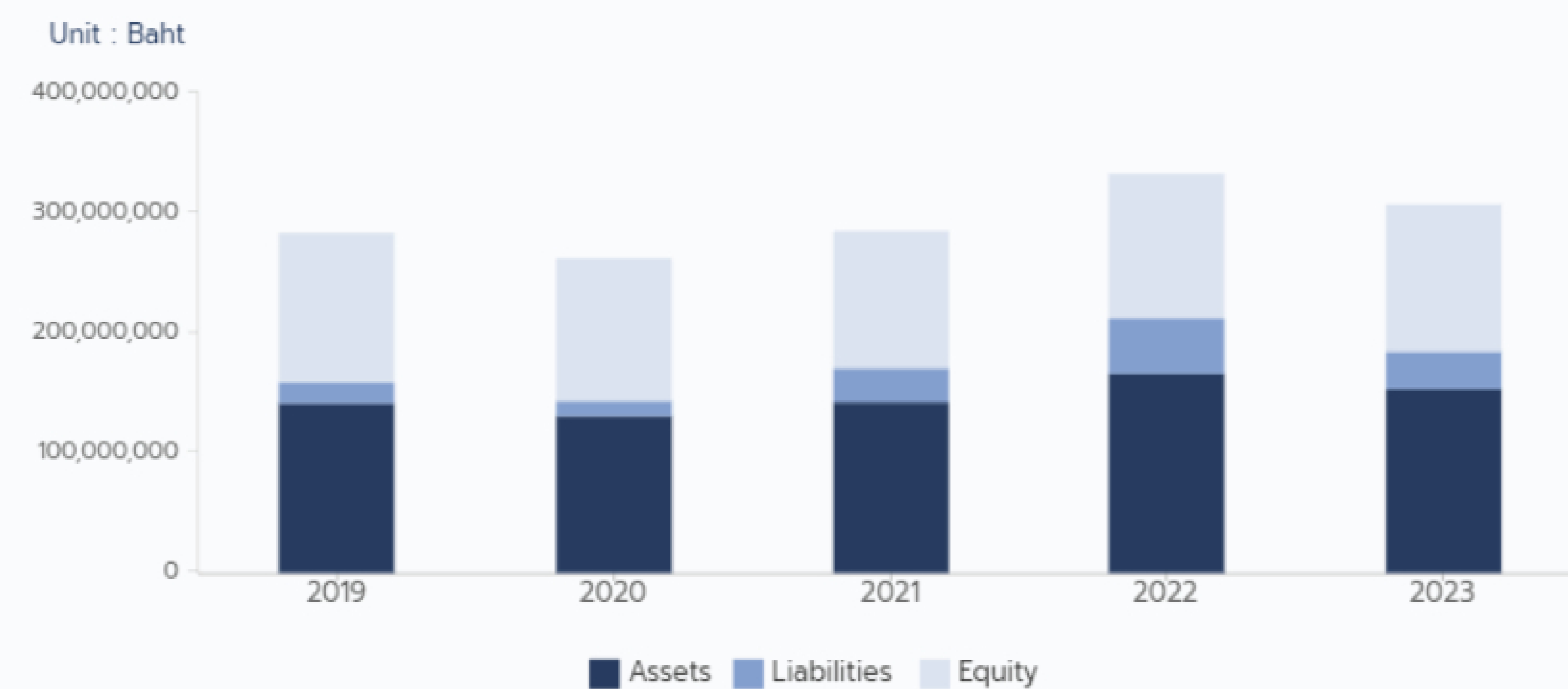
Balance Sheet Proportion