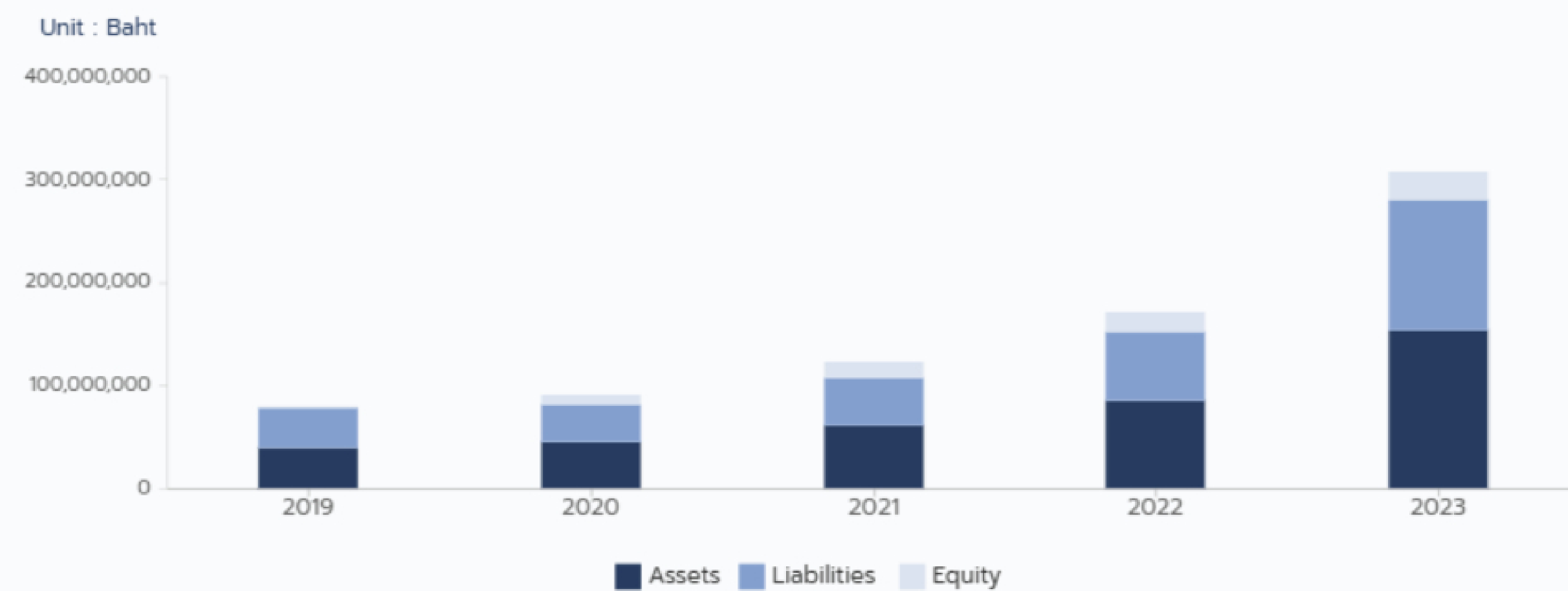
Balance Sheet Proportion