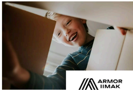
Ribbons for Thermal Transfer printing