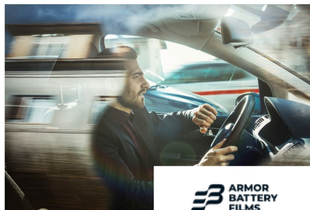
Foils for batteries