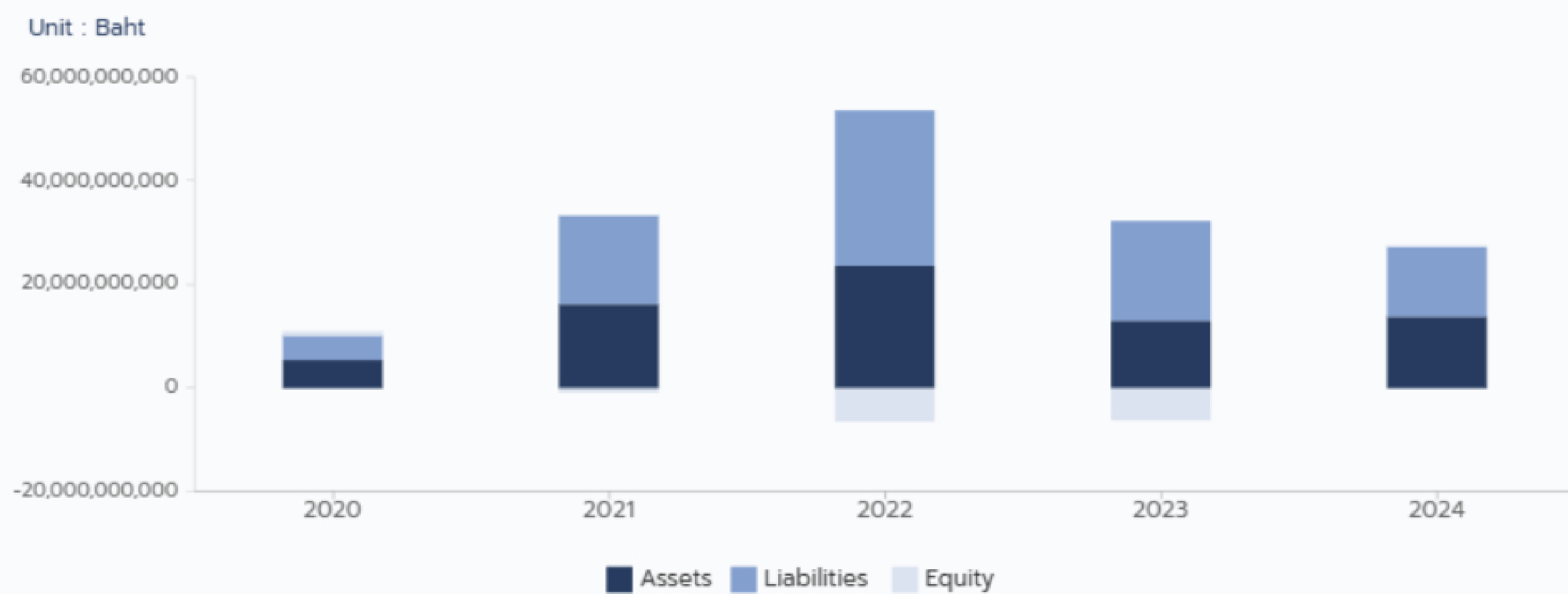
Balance Sheet Proportion