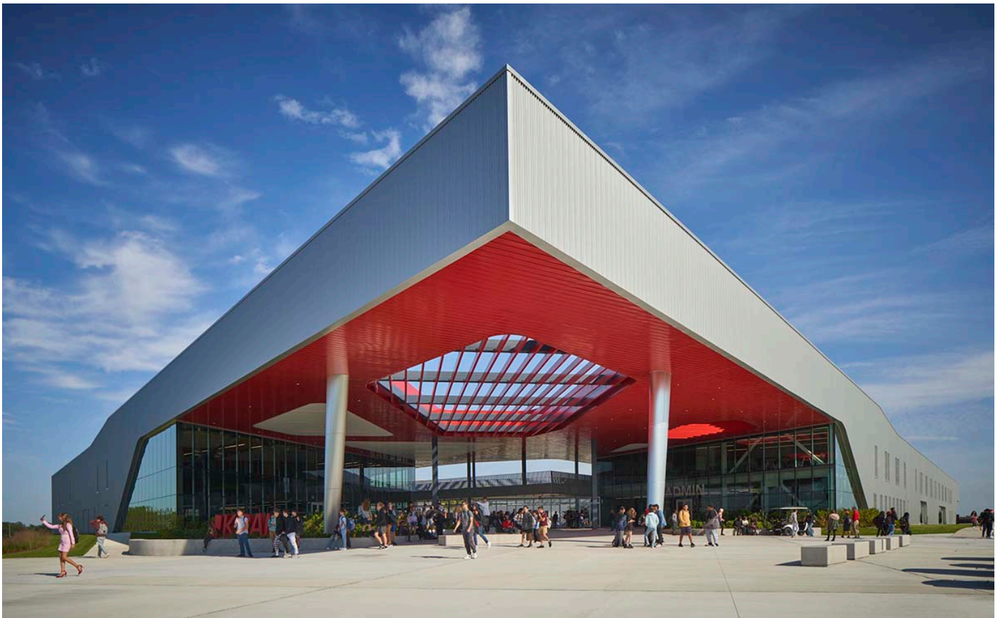
Kirkland Ranch Academy of Innovation — Pasco County Schools by CannonDesign, Tampa, Florida.

Beyond a few significant departures and new arrivals within the upper reaches of the ranking, the rest of the top 25 remained largely steady. Firms with ranking-boosting increases in revenue include the Midwest-based trio of DLR Group (17 th to 16 th ), stadium specialists Populous (19 th to 17 th ), and NORR (29 th to 23 rd ). Firms that slipped include ZGF (12 th to 14 th ), SmithGroup (16 th to 19 th ), and Ware Malcomb, which rose from 24 th to 15 th place in 2022 only to fall back to 21 st this year. Minneapolis-based HGA, which made the staggering jump from 101 st - to 23 rd -place last year after a near-quadrupling of revenue, dropped slightly to the 24 th spot.