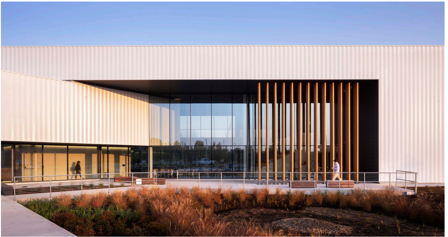
ZEISS Michigan Quality Excellence Center by SmithGroup, Lyon Township, Michigan.

Skidmore, Owings & Merrill and Kohn Pedersen Fox Associates also experienced declines: SOM continued a gradual fall down the list from 10 th place in 2021, to 11 th in 2022, to 12 th this year with a reported revenue of $259 million. With a revenue of $186 million in this year's ranking, KPF declined from 18 th to 22 nd —a nearly 10-spot drop from 2021.